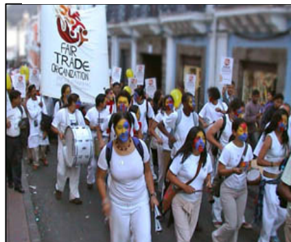
Global Journey in Malta

INTERESTED IN HOLDING AN EVENT? PLEASE SEE THE MAP ON THE NEXT PAGE TO SEE WHEN THE GLOBAL JOURNEY IS IN YOUR AREA. CONTACT KATE MEAKIN AT UKGLOBALJOURNEY@YAHOO.CO.UK OR RING 07840 485344