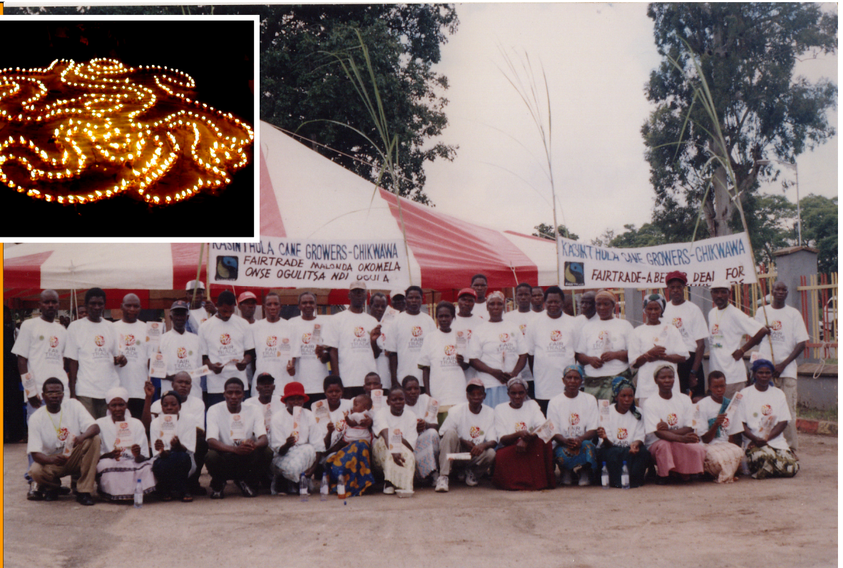
Global Journey in Malawi

Welcome to the January edition of the Global Journey newsletter.