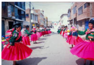
Global Journey in Peru