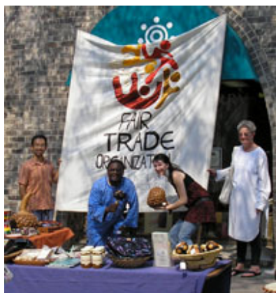
Global Journey workshop in USA

The Global Journey of the Fair Trade Organization Mark banner has been on the move for two years now and has attended over a hundred different events. To have a look at the different events and ideas that fellow participants have had please visit