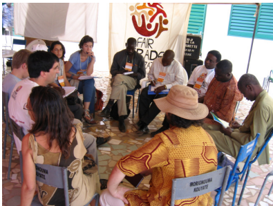
Global Journey workshop in Mali

Welcome to the January edition of the Global Journey newsletter.